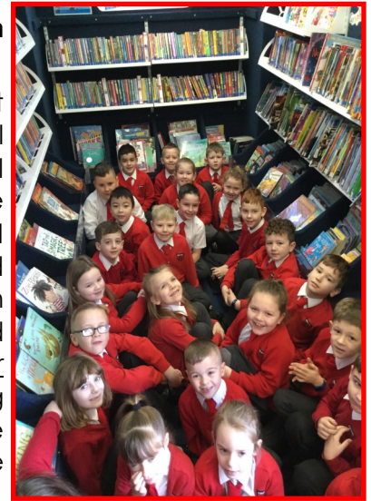
Listening to a story on the School Library Bus

We are attempting to keep as close to normal routines as we can, minimising disruption and assisting our return back to normal as soon as possible. We will of course maintain the safety of children and staff as our main priority.