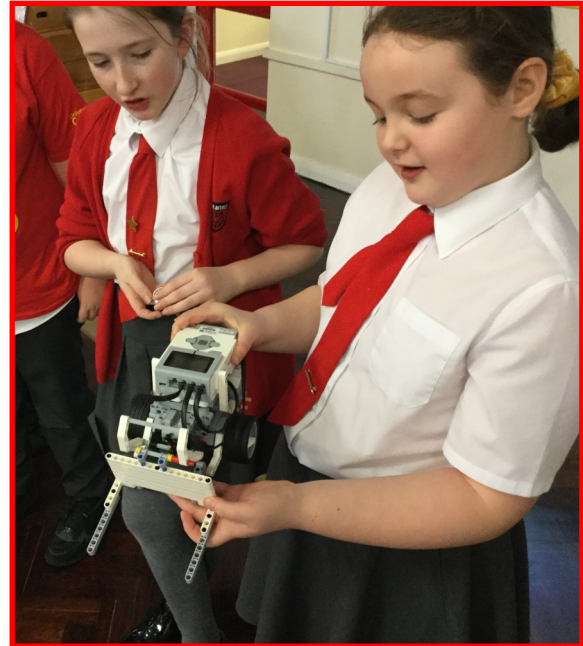
Our award winning 'Tech Team' Stars of the future...