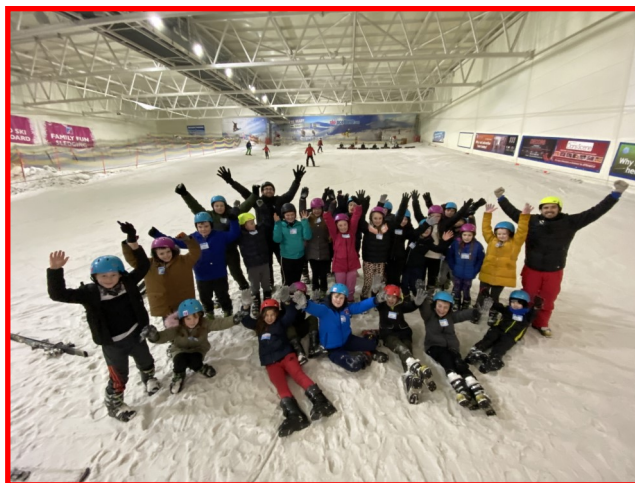
Our amazing Ski Club at the 'Snow Factor' indoor ski centre in Glasgow (February 2020).