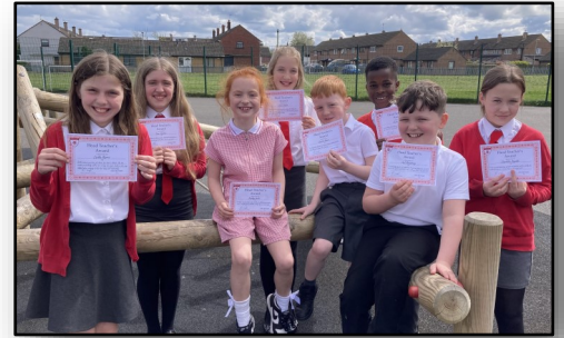
This weeks Head Teacher Award winners.