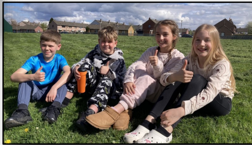
Year 6 School Council representatives

PJ day was a hit with the children (not so much the adults) in school. A great day with over £200 being raised for The Dogs Trust charity. I'm not sure how much school work was completed though!