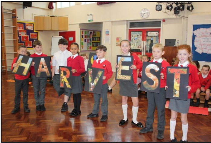
Y4: Harvest Around the World – performance

Religious education in school is required by law: "To be non-denominational but based on Christian thought with some opportunity to study other religions."