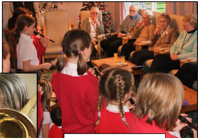
Christmas Carols for the old folks.

Visiting instrumental teachers make it possible flute, saxophone, clarinet, and guitar. We will seek to children who declare an interest in this. Parents will be asked to contribute towards the cost of providing extra voluntary instrumental tuition. Singing is a regular feature within our school and your child will be given opportunities to perform, such as in our Christmas productions.