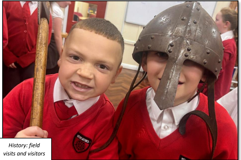
History: field visits and visitors to support learning

Developing an awareness of what is around us and why it has come to be this way is a fascinating part of your child's development. We develop these studies through field trips both near and far, and through investigations. Where possible our studies concentrate upon your child's experiences and build upon these. Within History we aim to build a timeline of understanding stretching from ancient history through to recent historical events.