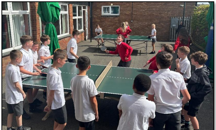
Table Tennis area.

Medical Information: If a pupil has a serious or recurring medical problem, it is advisable for parents to inform the school so that a note can be made in their child's records and appropriate actions and/or precautions can be established. If you are unsure whether the school is fully aware of your child's needs, please contact school to check.