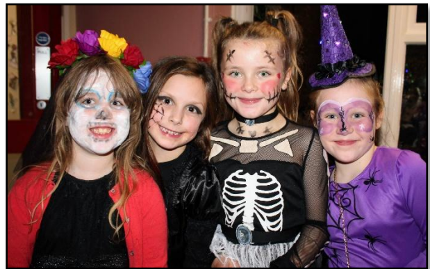
PTFA: Halloween Disco!

They aim to raise money to benefit all our children organising disco's, raffles, lucky number draws, no school uniform days, fairs and many more activities.