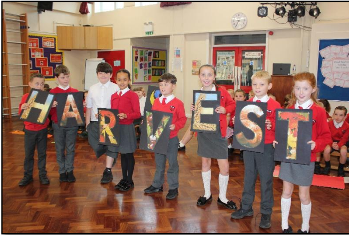
Y4: Harvest Around the World – performance

Religious education in school is required by law: "To be non-denominational but based on Christian thought with some opportunity to study other religions."