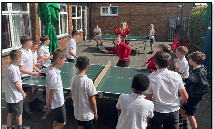
Table Tennis area.

Medical Information: If a pupil has a serious or recurring medical problem, it is advisable for parents to inform the school so that a note can be made in their child's records and appropriate actions and/or precautions can be established. If you are unsure whether the school is fully aware of your child's needs, please contact school to check.