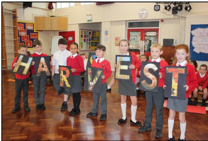
Y4: Harvest Around the World – performance

Religious education in school is required by law: "To be non-denominational but based on Christian thought with some opportunity to study other religions."