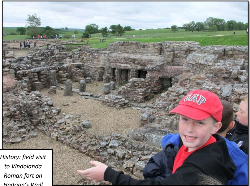
History: field visit to Vindolanda Roman fort on Hadrian's Wall

Developing an awareness of what is around us and why it has come to be this way is a fascinating part of your child's development. We develop these studies through field trips both near and far, and through investigations. Where possible our studies concentrate upon your child's experiences and build upon these. Within History we aim to build a timeline of understanding stretching from ancient history through to recent historical events.