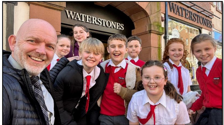
Competition winners visit

Our school uses a range of reading books, carefully graded to match your child's ability. We use the accredited Little Wandle phonics scheme to support children in their early reading development. We want your child to read for pleasure and understanding as well as