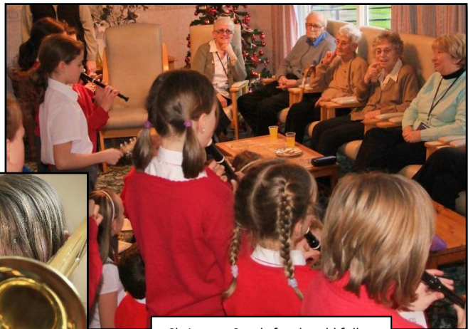
Christmas Carols for the old folks.

children who declare an interest in this. Parents will be asked to contribute towards the cost of providing extra voluntary instrumental tuition. Singing is a regular feature within our school and your child will be given opportunities to perform, such as in our Christmas productions.