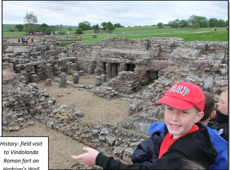
History: field visit to Vindolanda Roman fort on Hadrian's Wall

Developing an awareness of what is around us and why it has come to be this way is a fascinating part of your child's development. We develop these studies through field trips both near and far, and through investigations. Where possible our studies concentrate upon your child's experiences and build upon these. Within History we aim to build a timeline of understanding stretching from ancient history through to recent historical events.