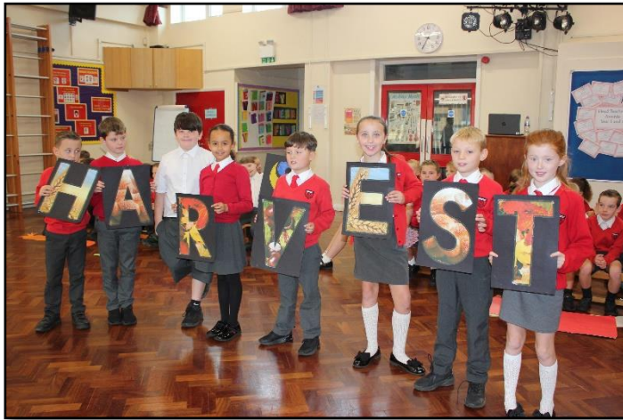
Y4: Harvest Around the World – performance

Religious education in school is required by law: "To be non-denominational but based on Christian thought with some opportunity to study other religions."