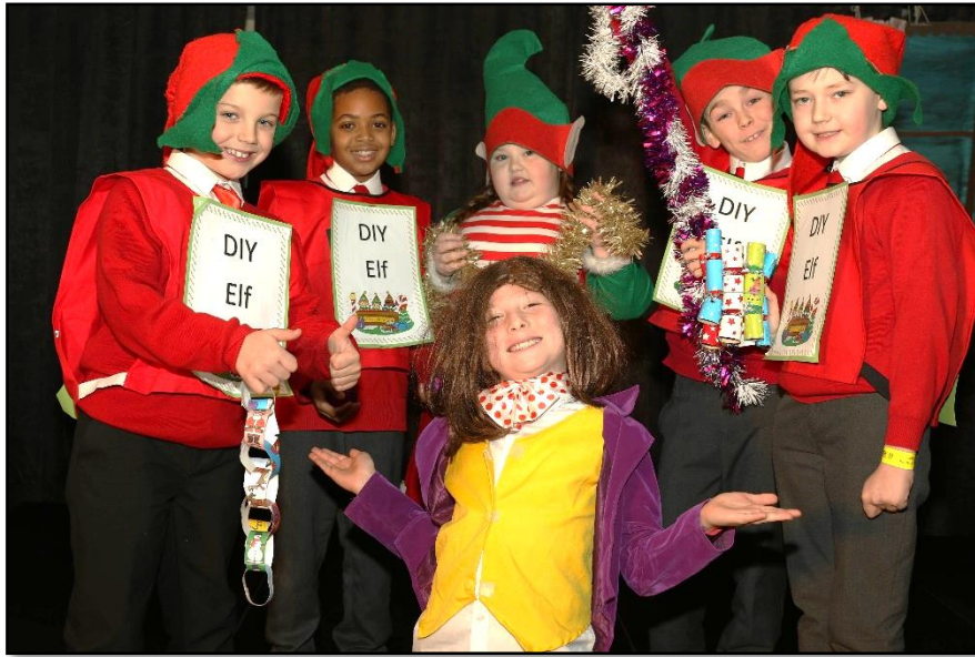
Y5: Christmas Performance

TERM DATES – please see our school website for term dates.