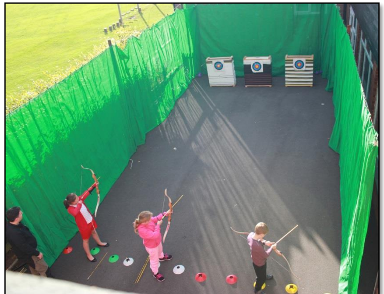
Our archery range.

Medical Information: If a pupil has a serious or recurring medical problem, it is advisable for parents to inform the school so that a note can be made in their child's records and appropriate actions and/or precautions can be established. If you are unsure whether the school is fully aware of your child's needs, please contact school to check.