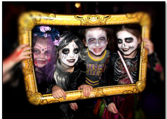
PTFA: Halloween Disco!

They aim to raise money to benefit all our children organising disco's, raffles, lucky number draws, no school uniform days, fairs and many more activities.