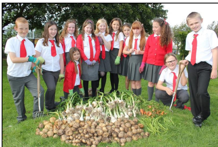
Produce from our Gardening Club

us to support and encourage a wide variety of activities over and above the normal curriculum.