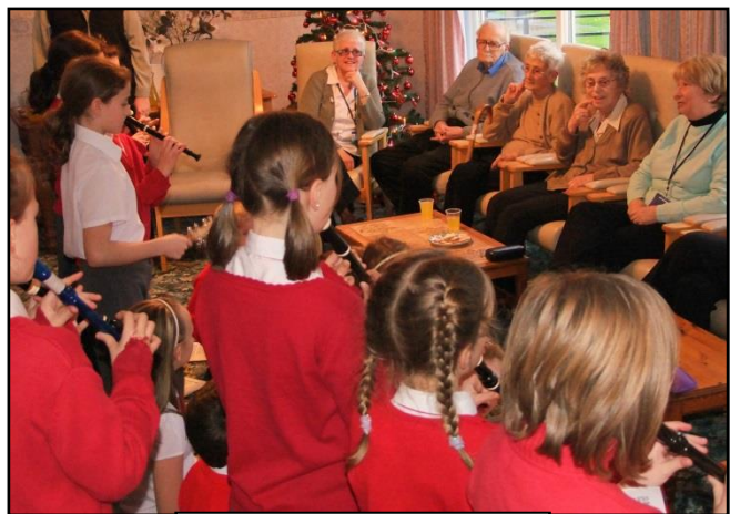
Christmas Carols for the old folks.

Visiting instrumental teachers make it possible for selected children to learn flute, saxophone, clarinet, violin, viola,